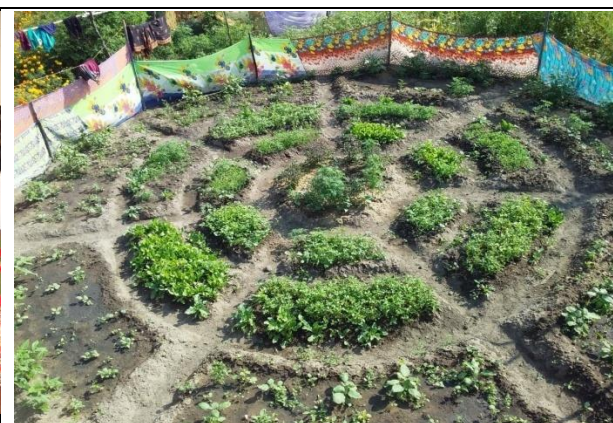
To assess the Kitchen grading for tribal farmwoman