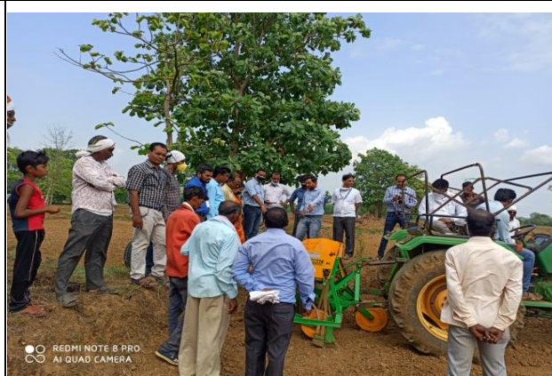
Assessment of paddy transplanting and sowing by using paddy transplanter and DSR machine